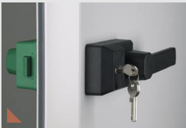
Door handle with lock