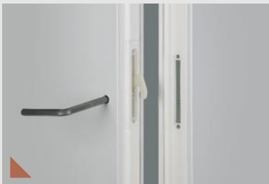
Tongue-and-groove with integrated locking system