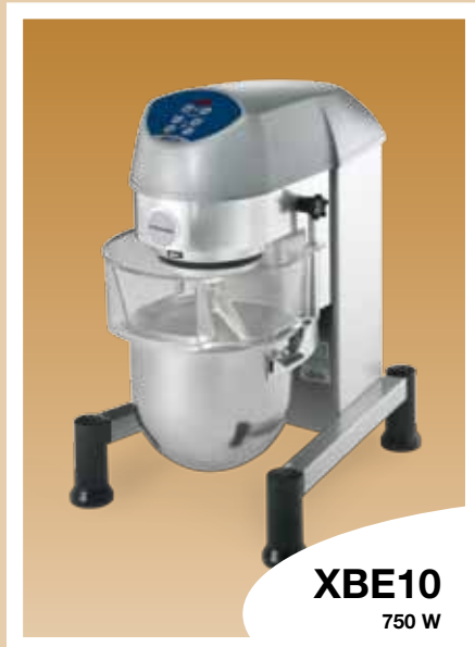
XBE10 750 W

10 litre planetary mixer to satisfy all requirements of a professional kitchen