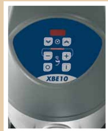
Touch button control panel