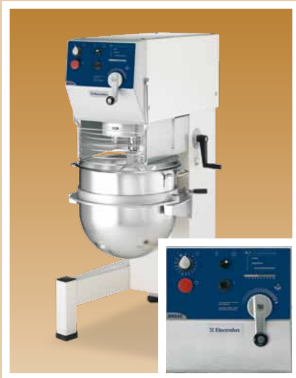
BMX60AS - 60 litres - mechanical speed variation

60/80 litre professional mixers. Powerful motor (4000 W) with an exceptional range of speeds, from 20 to 180 rpm