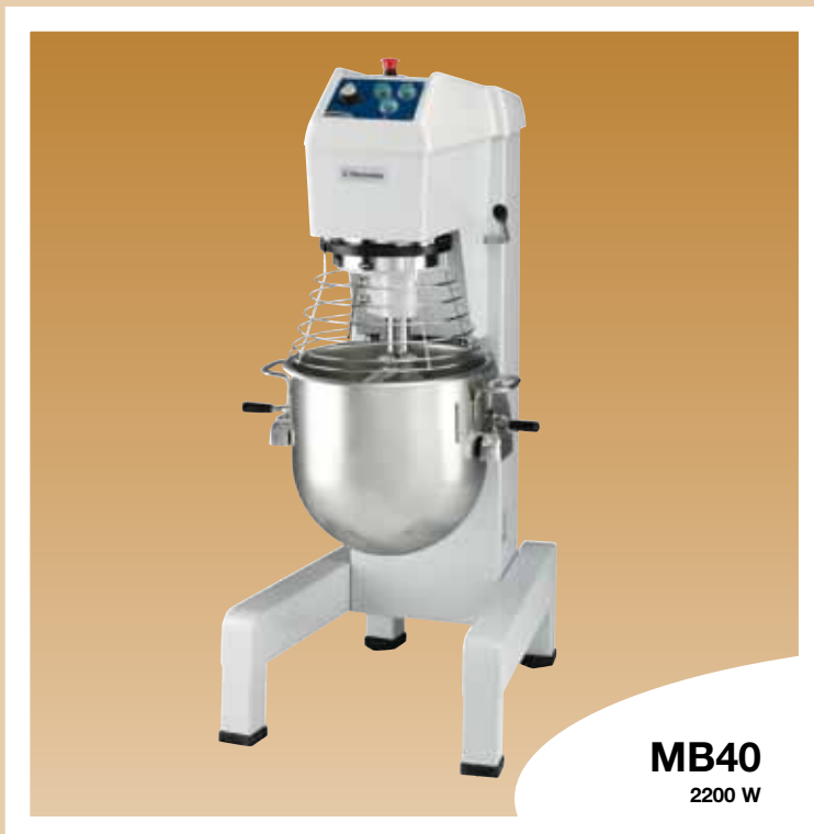
MB40 2200 W

Electrolux offers a complete range of planetary mixers designed to withstand the strong demands of bakery and pastry making.