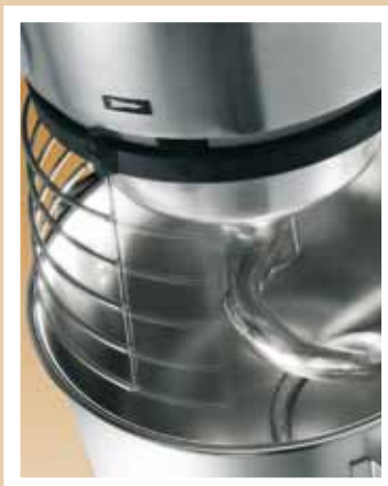
Wire safety screen