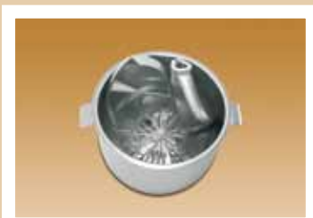
Bowl reduction kit with 3 tools