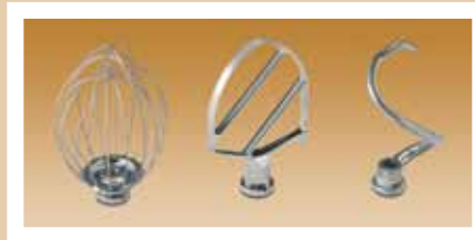
3 tools: whisk, paddle, spiral hook