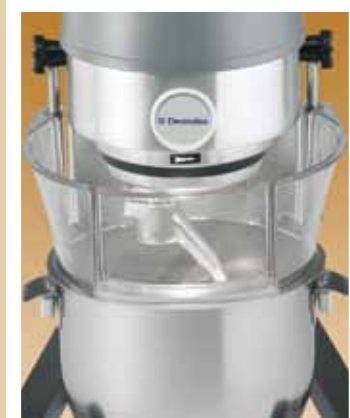
Transparent safety screen