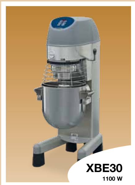
XBE30 1100 W

20/30/40 litre professional mixers are an essential item for all kitchens using fresh ingredients to prepare pastry bases, creams, mousses and mixtures of all types