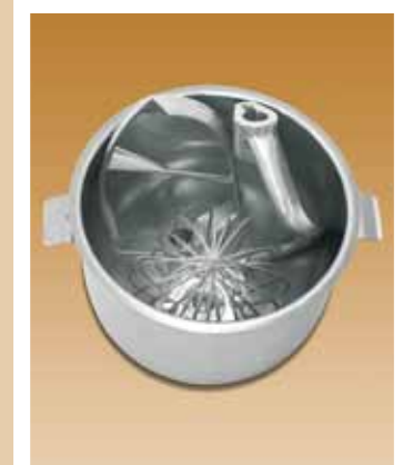
Kit (bowl, hook, paddle, whisk)