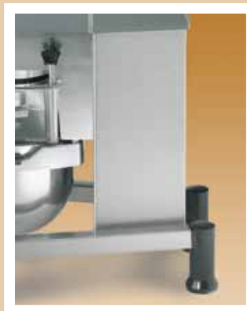
Stainless steel column